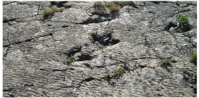
Dinosaur prints dating back about 132 million years have been identified in the Western Cape's Brenton Formation.

Before this discovery and a similar 140-million-year-old find